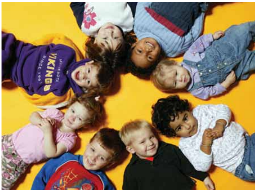
The Minnesota Thrive Initiative promotes the healthy social and emotional development of infants and young children.