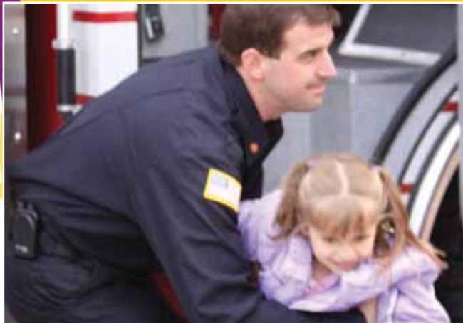
Emergency First Responders can leave a lasting positive impact on children in traumatic situations.