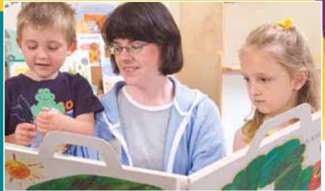
Parents in the Incredible Years receive coaching while children participate in group play, reading, and other activities.

How can a county help parents who are stressed to the limit trying to make ends meet and care for their children? Many times that stress can lead to short fuses and unwise, even harmful, responses to their children's demands and behavior.