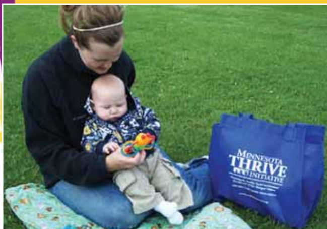
A new mom offers warmth and care in her interaction with her baby, so he can feel safe as he is learning.