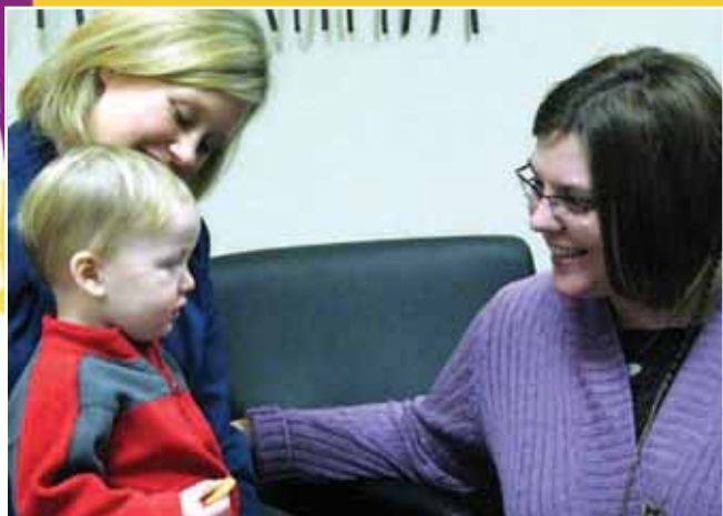
Families meet with the Care Coordinator to plan the next step.